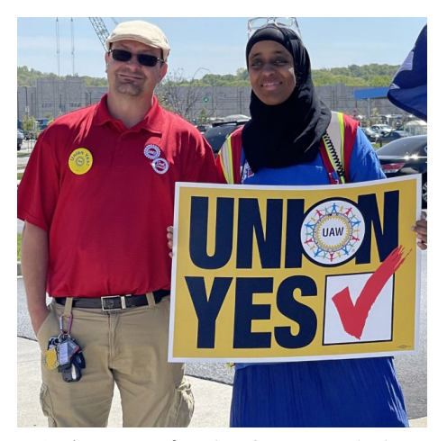
Workers at Yanfeng in KC vote to unionize