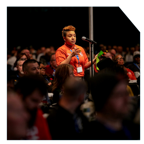
Special Bargaining Convention 2023