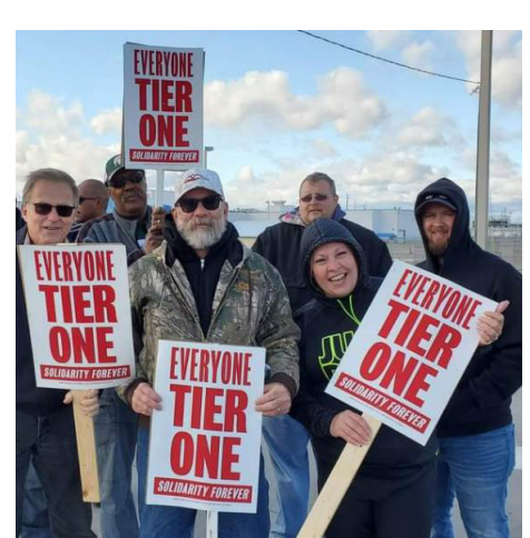
Beyond Borders: Member's Voice