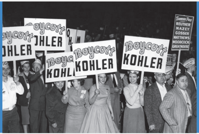
Women hold picket signs to show support for the Kohler Strikers, possibly at the 1955 UAW Convention, Cleveland, Ohio.