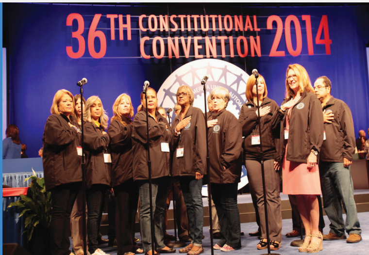
UAW members representing Puerto Rico sing the Puerto Rican national anthem.