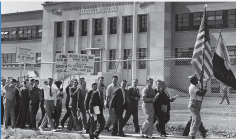
UAW members, in town to attend the 1941 Convention, take time to help organize the Curtiss Wright Corporation, Airplane Division, Buffalo, New York.