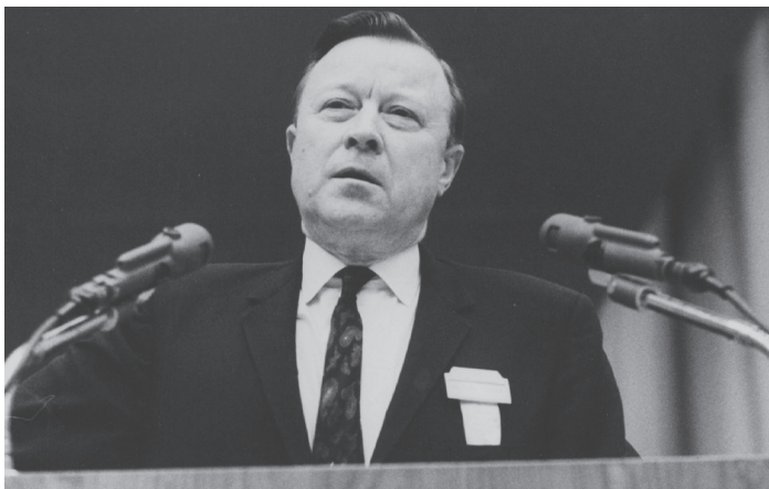
UAW President Walter Reuther, UAW Constitutional Convention 1966.