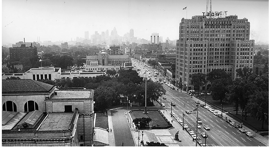
WDET, seen here in the 1960s atop the Maccabees Building, was powered up 70 years ago by Wayne State after it acquired UAW's original facility, studio and equipment for $1.