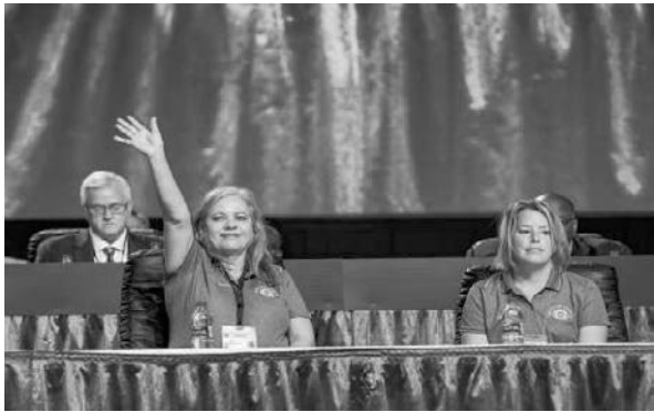
Members of the Constitution Committee are introduced.

The UAW is politically active because our ability to make progress for workers at the bargaining table is tied to our ability to elect pro-labor candidates to office. Federal, state, and local officials make countless decisions that impact the well-being and quality of life for working Americans; these decisions can support or undercut contract provisions we negotiate at the bargaining table. We must remain actively involved in the political process in order to advance the interests of workers on issues like work-place health and safety, trade policy, the right to organize, the right to a fair collective bargaining process, pensions, Social