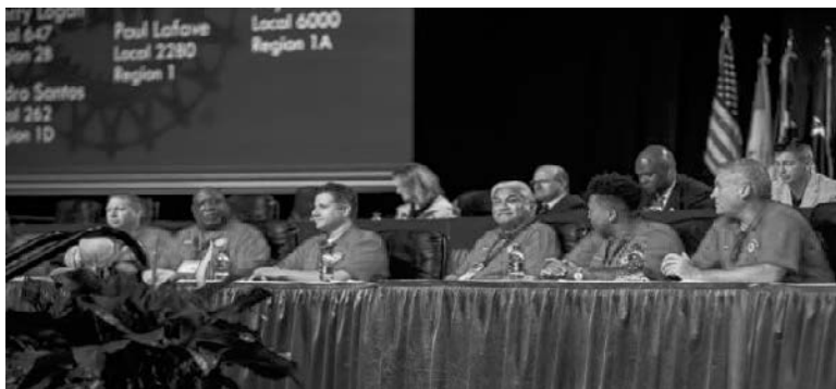
Members of the Resolution Committee are introduced.

The world outside of the bargaining table poses numerous challenges to winning a fair agreement for workers. But the UAW has a seat at the table for management. And opportunities to be heard and to shape the future of the UAW members for the next four years. Thank you. (Applause)