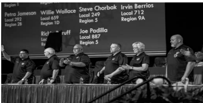
Members of the Credentials Committee.

Under Article 8, Section 17, subsection E, of the UAW International Constitution, the Credentials Committee has full authority to receive delegate election protest, evaluate them, report its findings and recommendations to the full convention. The convention itself is the final authority and so it makes the final disposition of all election protests.