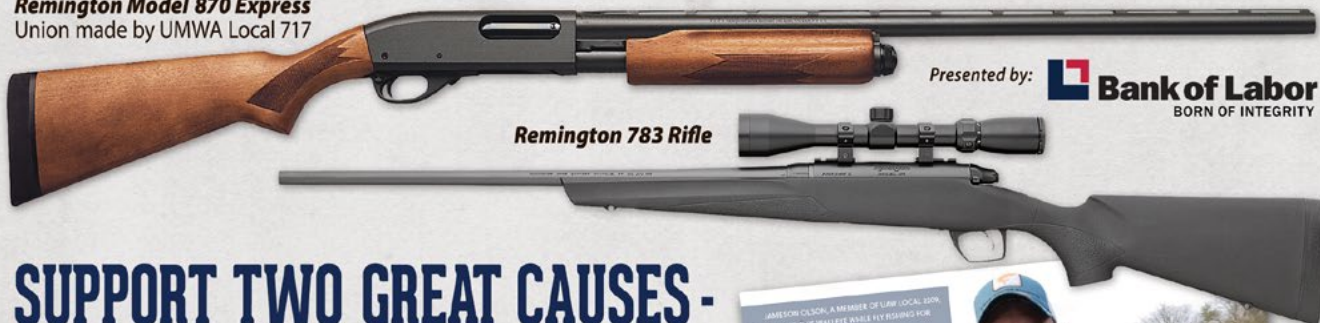
Remington 783 Rifle

Presented by: Bank of Labor BORN OF INTEGRITY