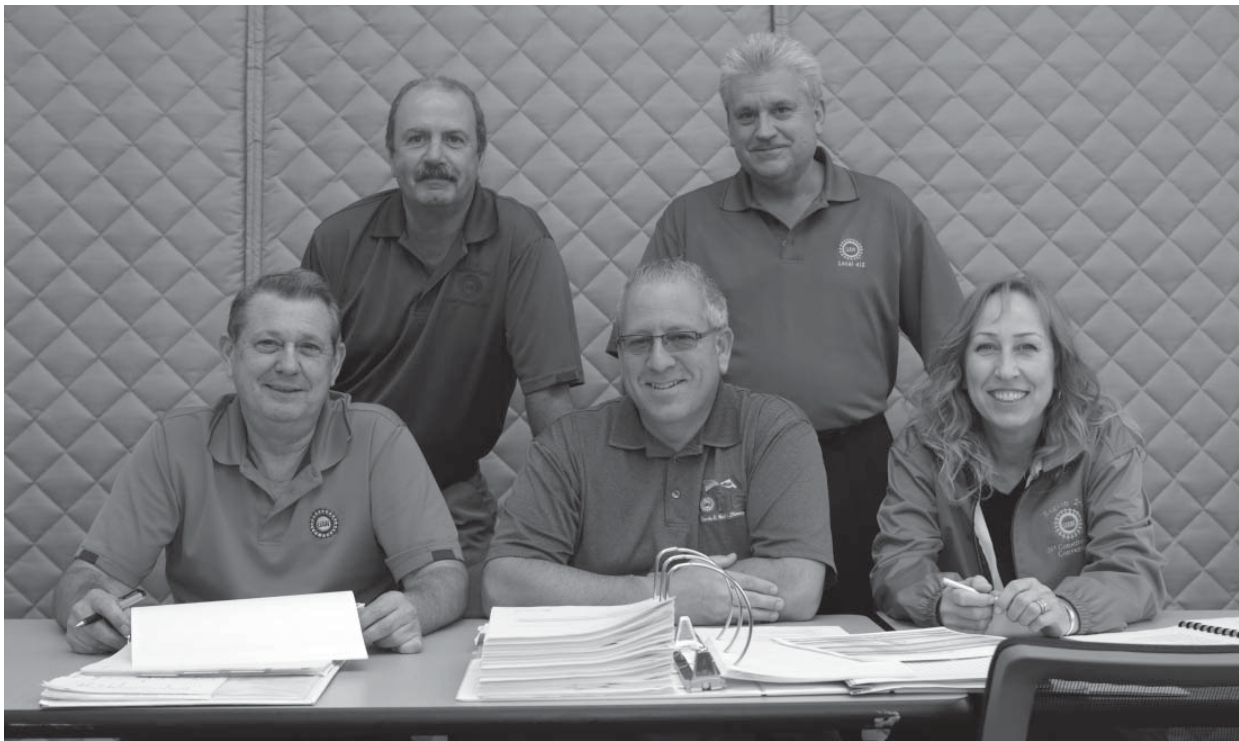
Salary Bargaining Unit Negotiators

Local unit chairpersons who leave the facility during their scheduled hours to perform services for the benefit of the company will be compensated for their time away from the facility up to eight hours per month.