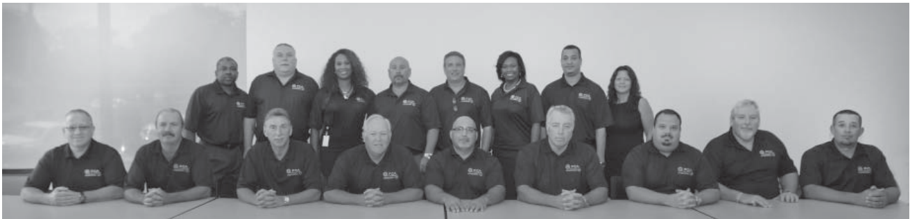
The 2015 UAW FCA National Bargaining Committee